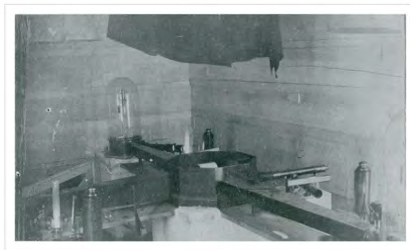
A photograph of the Kew-pattern magnetograph system in place in the Los Angeles observatory. Note that the lid on the recording box has been removed, showing the recording cylinder inside.